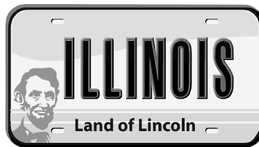
license plate ↑

After you buy a car it is important that you take care of it so that it is safe to drive. The DMV will make you get an inspection on your vehicle. You will have to get an inspection every year. You have to take it to a mechanic for the inspection. If your car is not safe to drive, it will not pass inspection. You will have to take it off the road.